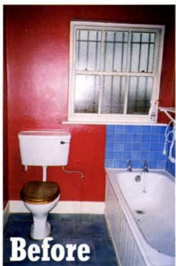
Before The room was a red, white and blue disaster. The startling colour scheme overpowered the small room and everything needed ripping out as the walls were damp and the floors rotten