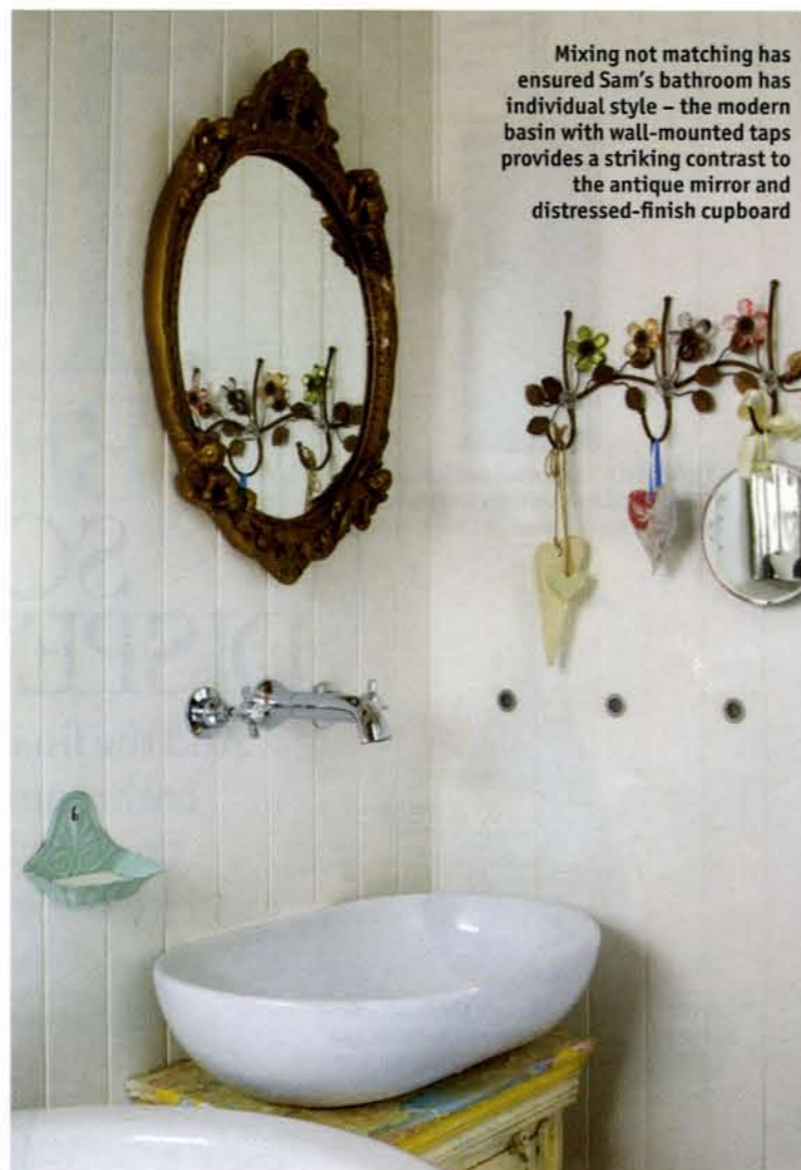
Mixing not matching has ensured Sam's bathroom has individual style – the modern basin with wall-mounted taps provides a striking contrast to the antique mirror and distressed-finish cupboard

the panelling is perfect for this. It also makes a great backdrop for all the antique French furniture and ornaments that I've picked up from antiques fairs here and in France over the years. Most of the ornaments were bargains, but there are a few high-quality items, like the antique mirror over the basin, so the overall look of the room is luxurious. »